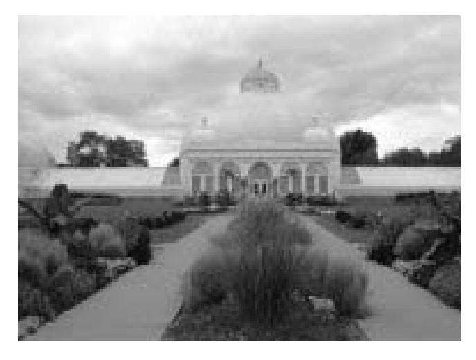
The Buffalo and Erie County Botanical Gardens

www.buffalogardens.com ($6) Designed by the prestigious greenhouse firm Lord and Burnham in the 1890s, the Buffalo and Erie County Botanical Gardens remains one of