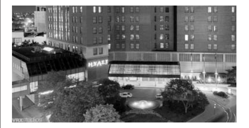
The Hyatt Regency Buffalo at night

Airport Transportation: ITA Shuttle Service leaves the airport every hour on the hour, and leaves the hotel every 20 minutes past the hour. The shuttle operates from 7:00 a.m. to 9:00