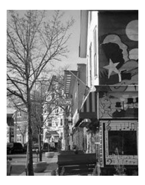
Buffalo's historic Allentown

Reviews (2,000-5,000): Reviews must be of significant, intriguing, or unusual primary source materials. These reviews will assess and underscore those materials' importance either for various research profiles or for curricula and classroom syllabi. Of particular interest for this section are short reviews of scholarly editions, hypertext/internet literatures, visual culture, popular culture, and, of course, novels, short stories, poetry, plays, films, comic books, and creative non-fiction.