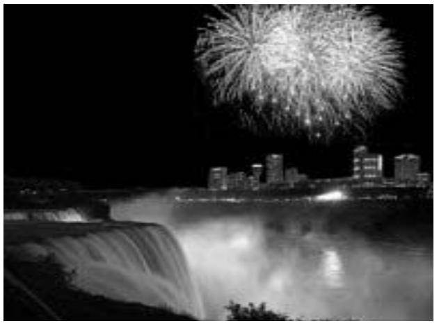
Fireworks over Niagara Falls

Niagara Falls Evening Tour (American Side) Niagara Falls—one of the Seven Wonders of the World. In the evening, various colored lights are